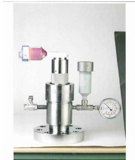
Flange Connection Model