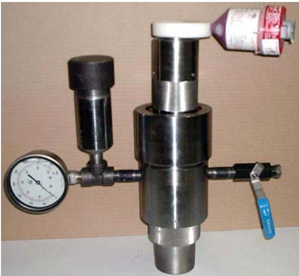
Flow Tee Connection Model